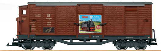
41024 LGB "Öchsle Museum Railroad" Museum Car for 2024

A prototypical train for the Öchsle Museum Railroad can be made by combining this car with the 20483 locomotiv, and the 41024 museum car.